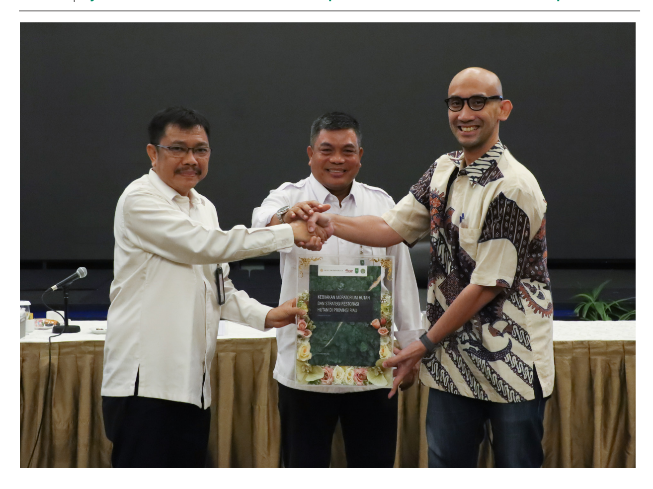
Picture 3 | Symbolic handover of our TCI research report to Riau Provincial Government Representatives

to better align community-based forest conservation efforts with the issue of food security in Riau Province. This event was strategic since it could directly share our research insights to high-ranking provincial government officials gathered in this event. The recommendation from the research offers valuable inputs for the development of the Green Riau program, especially regarding the implementation of SF in Riau.